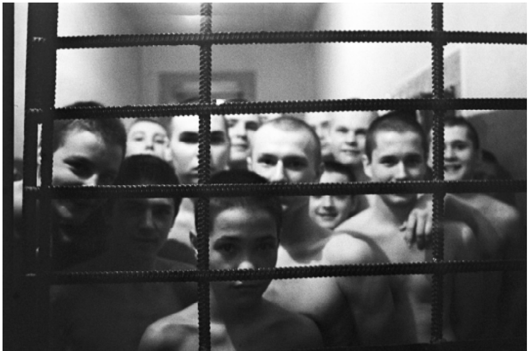
Child prisoners held without trial in unsanitary conditions, Russia, 1999