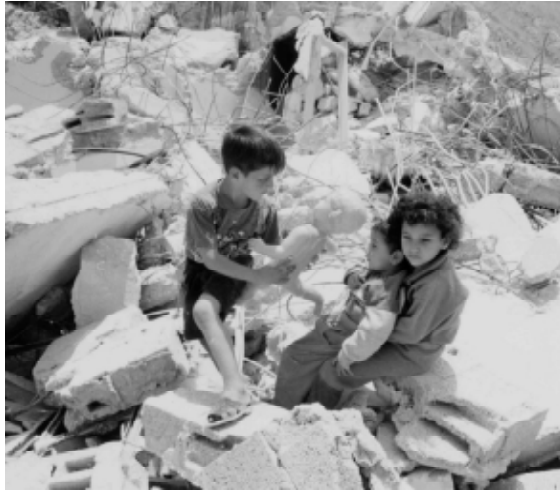
Children among the ruins of their house, Israel, 1995