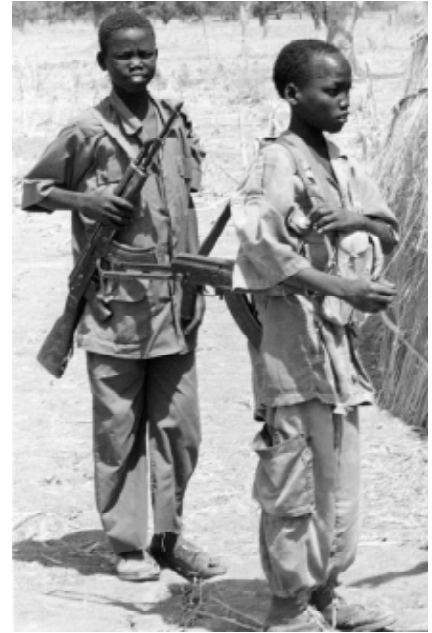
Child soldiers guarding oil fields, Sudan, 2000